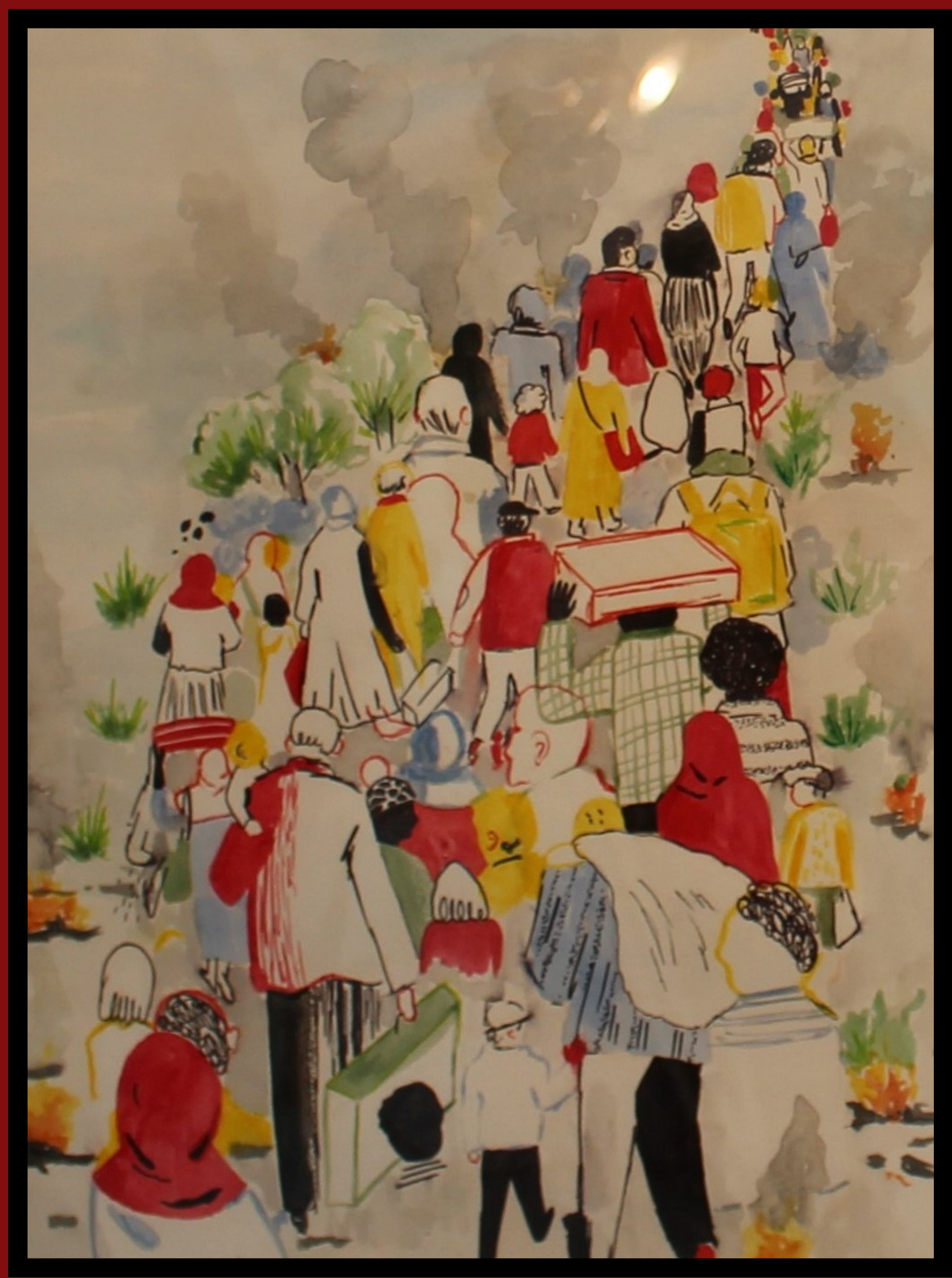
Migration - Sahar Taj Eddin - Class of 2023